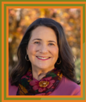
Diana Degette CD1