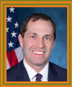
Jason Crow CD6

These leaders are poised to advance key policies such as healthcare access expansion, safeguarding reproductive rights, and improving protections for immigrant families and working-class communities.