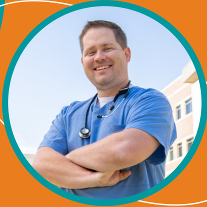
KYLE MULLICA Colorado Senate District 24 Adams County